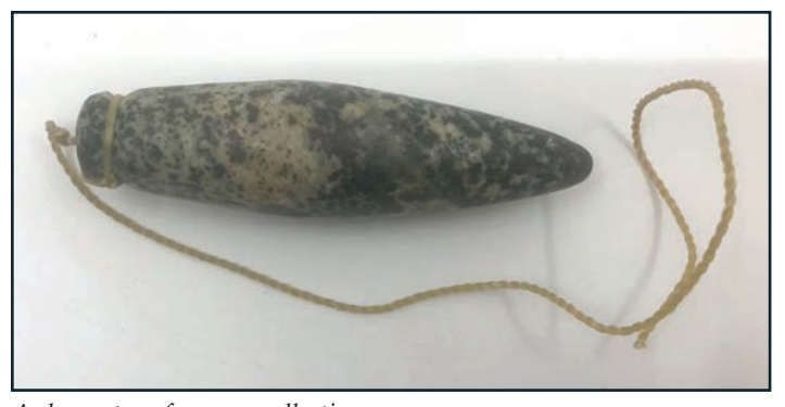
A charmstone from our collection.

The Muwekma people had a rich spiritual life. Their religion, known today as Kuksu, was a completely oral tradition. All knowledge was destroyed by the Spanish so we must rely on found objects to understand their faith. The Ohlone worshipped Nature and celebrated festivals by the seasons. They also had a great respect for animals, especially the eagle, coyote and hummingbird. We know the Kuksu religion was a type of shamanism where ceremonies and rites of passage were an important part of tribal life. Pre-contact, a shaman was a very distinguished member of the tribe with the ability to contact the spirit world for healing and guidance and in officiating important life milestones. Shamans had a kit of objects they used to perform various tasks. Among the most important were charmstones.