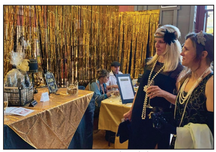
Two guests checking in at the Dancing through the Decades Gala.