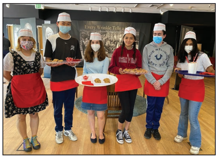
Teen docents at the closing party for Every Wrinkle Tells a Story.