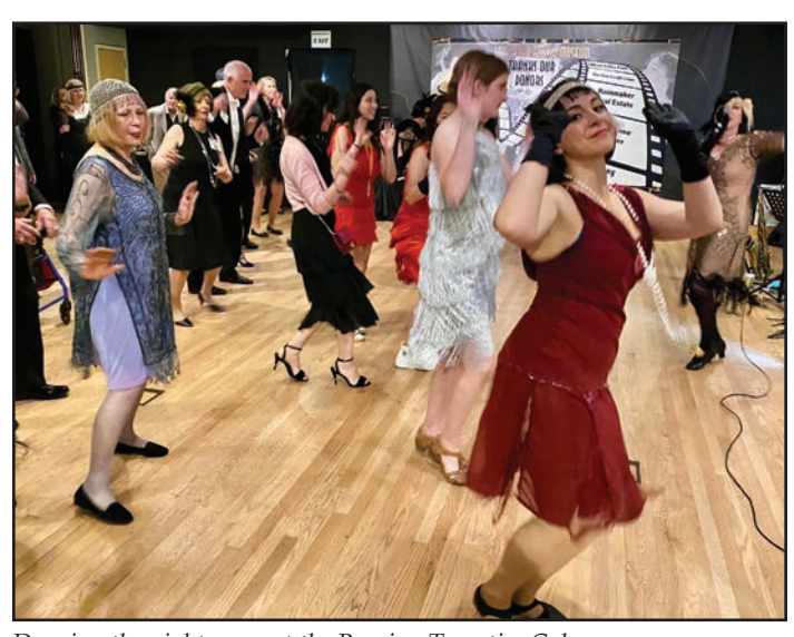
Dancing the night away at the Roaring Twenties Gala.